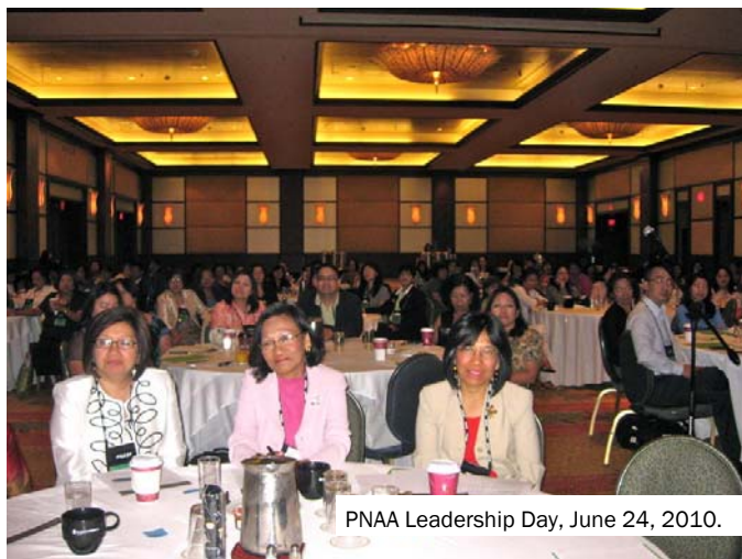
PNA Leadership Day, June 24, 2010.