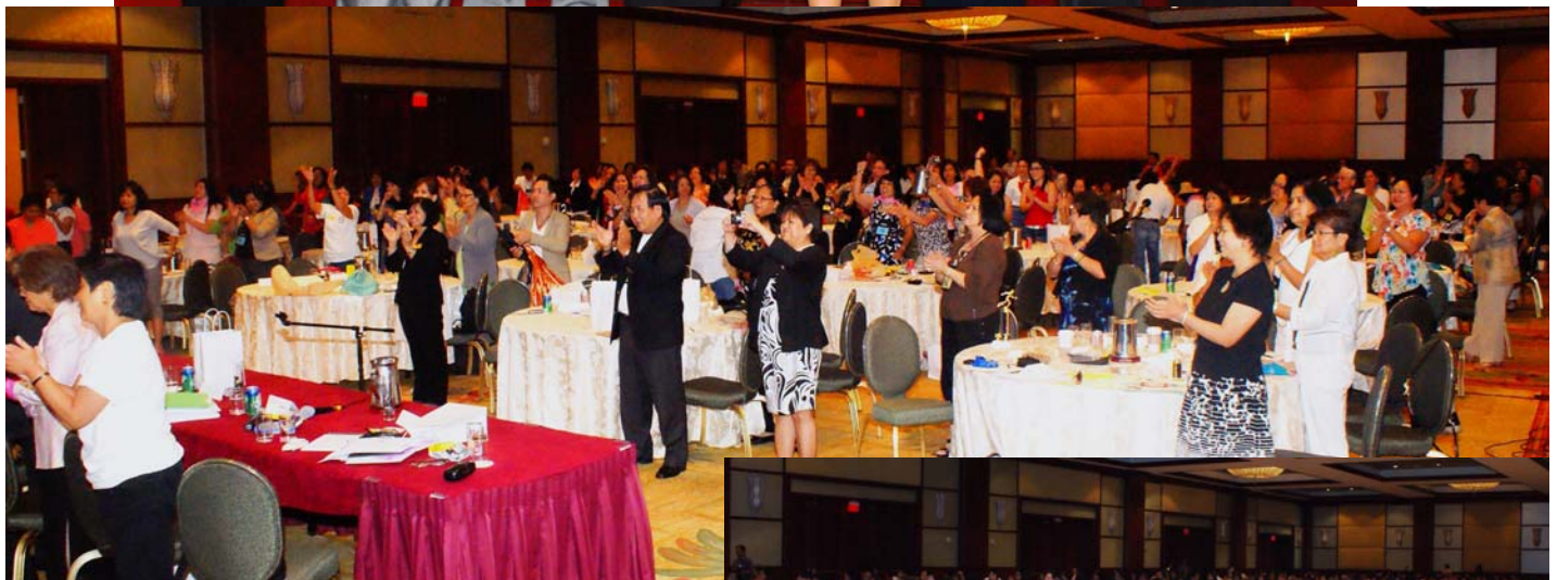
General Assembly, Friday, June 26, 2010