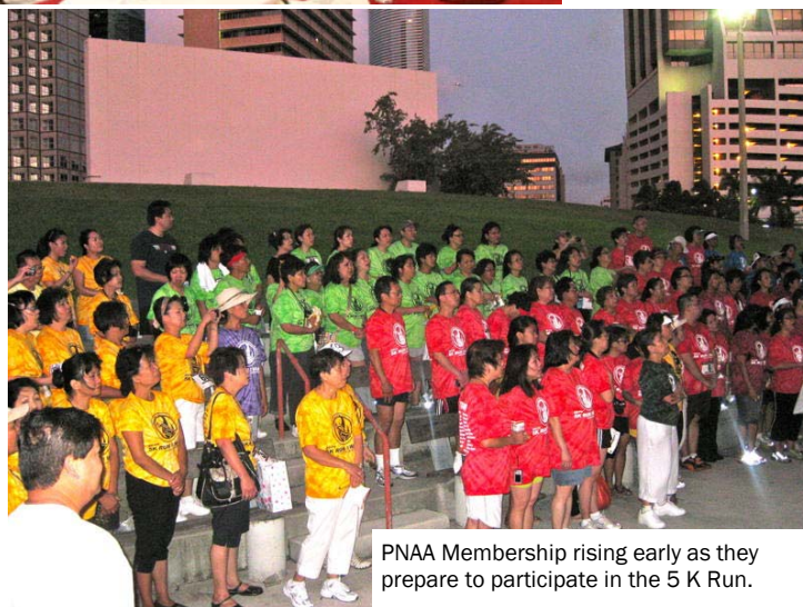
PNA Membership rising early as they prepare to participate in the 5 K Run.