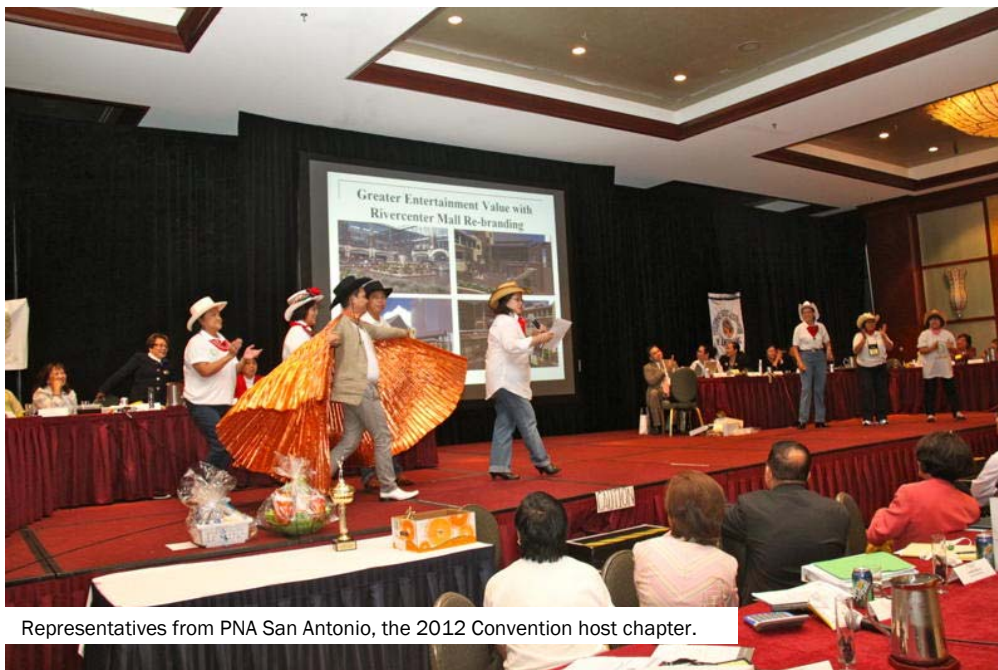
Representatives from PNA San Antonio, the 2012 Convention host chapter.