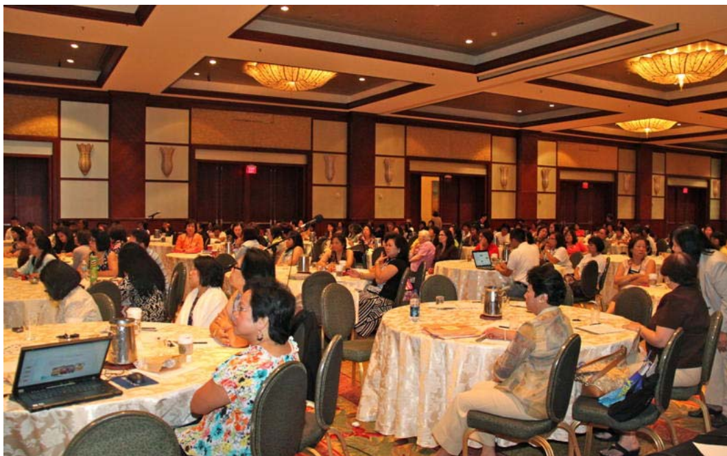
General Assembly -June 26, 2010. PNAA membership listening avidly to the PNAA business.